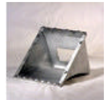
LWG - The ROLEX of non-commercial wheel chocks.